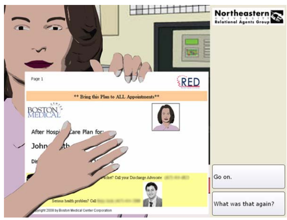
Figure 3. Virtual Nurse Interface

Finally, while some level of English reading literacy is required to use the system (since patients had to be able to read the AHCP booklet), patients with relatively low reading literacy were accommodated by keeping their utterance inputs as simple as possible (e.g., most consisted of "OK.", "Yes.", "No.", and "What?").