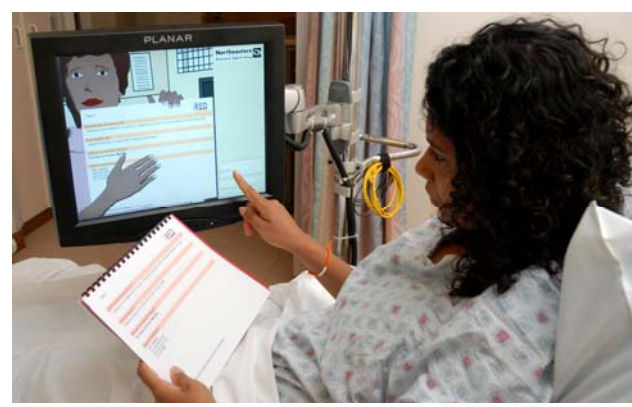
Figure 1. Patient Interacting with Virtual Nurse

In collaboration with a medical research team at Boston Medical Center, we have developed an automated system that teaches patients about their post-discharge self-care regimen while they are still in their hospital beds. In order to make the system as acceptable and effective as possible, we designed the interface to incorporate an animated virtual nurse (VN) who embodies best practices in health communication for patients with inadequate health literacy. The VN is deployed on a wheeled kiosk with a touch screen display attached to an articulated arm that can be positioned in front of patients while they are in bed (Figure 1). The VN spends approximately half an hour with each patient, reviewing the layout and contents of an "After Hospital Care Plan" (AHCP) booklet that is produced for them and contains their personal medical information. The paper booklet is given to patients before their conversation with the VN, and the VN reviews a digital version of the booklet in the interface, so that patients can follow along with the agent's explanation in their paper booklets.