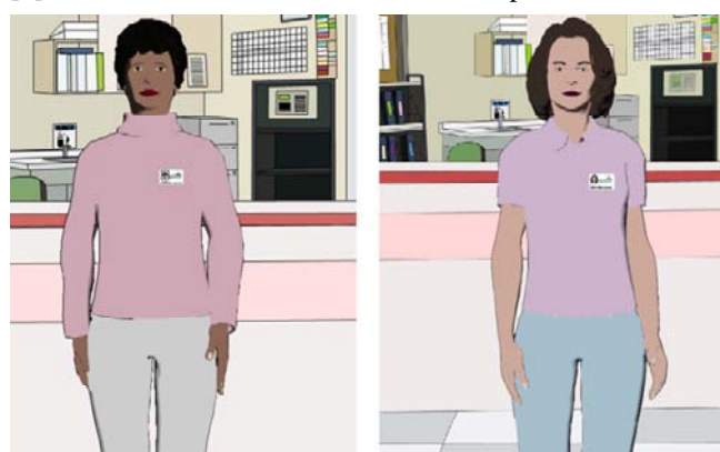
Figure 4. VN Characters: Louise (L) and Elizabeth (R)

The importance of caring, empathy and good "bedside manner" is widely recognized in healthcare as a key factor in improving not only patient satisfaction, but treatment outcomes across a wide range of health care disciplines [16], but particularly in nursing [30]. Given this, prior successful implementations of empathic computer agents [7], and the need for the VN to maintain patients' attention