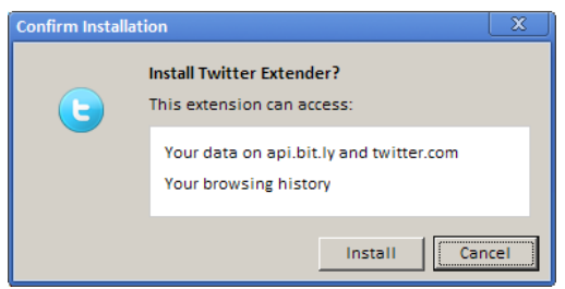
Fig. 2: A fragment of Twitter Extender's manifest and the dialog that prompts a user for access privileges when the extension is installed