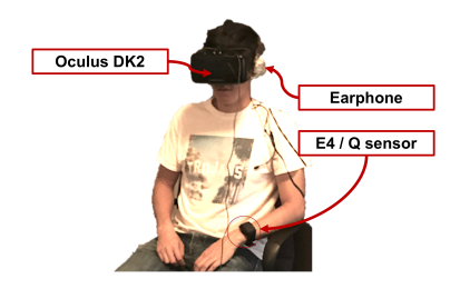
Figure 4: System Apparatus

were the Empatica E4 and the Affetiva Q sensor. SCL was measured over the course of the experiment, including at baseline (base), before approaching interaction(start), after approaching interaction(approach), and at post-task periods(post).