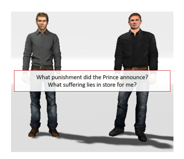
Figure 1: Screen-shot of the virtual environment. The character stands on the left is the virtual professor and the one on the right is another fellow student. The participants' lines will show up on the 3D interface in front of the participants.

examined nonverbal proxemics (body language) as a factor that might impact participants' reactions. For instance, people tend to attempt to calibrate an equilibrium of interpersonal distance when interacting with a virtual agent [26]. For a review of spatial construction of interactive virtual environments, see Blascovich [5].