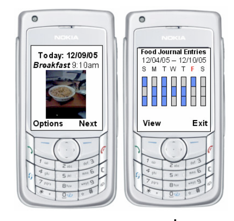
Figure 2. 2 screenshots of the FotoFit cell phone interface.

photographic medium, which our studies show as useful for supporting reflection and assessment of diet and exercise habits. In addition, our design supports the mobile lifestyle of a college student and is relatively inexpensive because it utilizes a camera phone and a PC, two devices that many students already own and exercise machines that many college campuses provide.