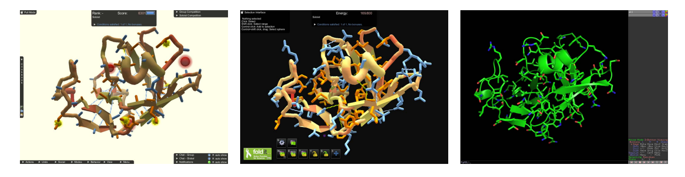
Figure 1: Screenshots of (left) Foldit game default visualization, (center) Foldit Standalone default visualization and (right) PyMOL [11]. All programs have loaded the same protein structure.

would typically do. Early online projects primarily allowed the public to collect environmental data, such as the presence of species in specific ecosystems [42]. The ESP Game had players provide labels for general images [46]. Stardust@home became the first citizen science project to challenge novice participants with the analysis of existing scientific data [48]. In the years that immediately followed, many projects launched. Some succeeded, others stagnated; citizen science growth and retention remains an unsolved problem [15]. Thus researchers grew keen to explore new interaction models in the hopes of improving the success of these new crowdsourcing platforms. GalaxyZoo [2], the debut project of Zooniverse, launched in 2007 with a new style of user-friendly interface and in the first two years recruited over 200,000 participants [34]. While GalaxyZoo successfully recruited many participants, other projects have explored turning into games as a practical means by which to address the challenge of recruiting and retaining users [18], as evidenced by the numerous successful examples of citizen science projects manifesting as serious games. Phylo [23] and Fraxinus [35] both deployed in the genomics field; EteRNA [29] focused on the design of secondary RNA structure; and Nanocrafter [3] examined DNA nanotechnology.