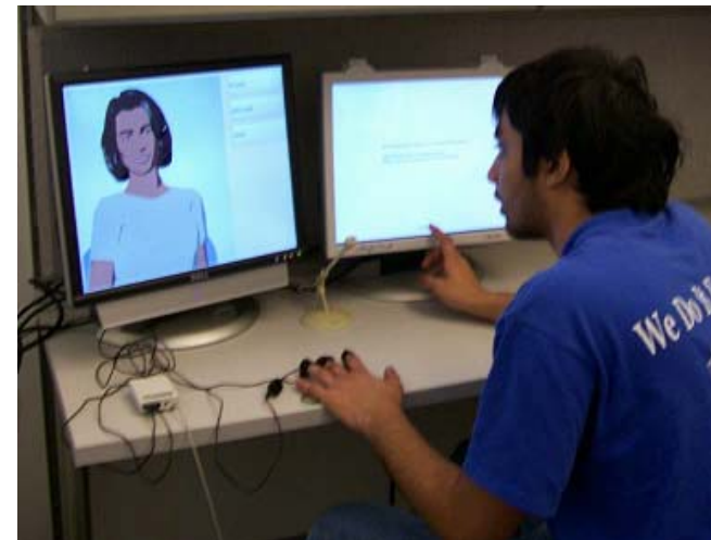
Figure 2. Experimental setup, with relational on left and touch screen induction computer on right.

Figure 2 shows the experimental setup. During the experiment we recorded subjects' heart rate using a finger-clip blood volume pulse sensor from Thought Technology Ltd.