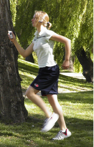
Figure 1. Can a mobile create a shared, jogging experience?