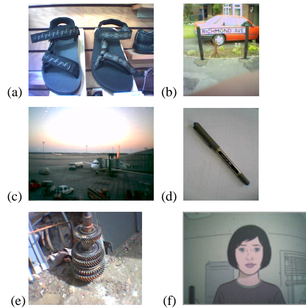
Figure 2. Images used to complete a task with someone who was absent at the time of capture.

The importance of timely delivery is reflected in the fact that about half of these images were sent at the time of capture. Figure 2(a) shows a choice of sandals which a woman found for her husband while shopping. She sent the image to his phone and immediately called him to discuss the selection. This mode of communication saved an extra shopping trip. Moreover, by sending the image, the woman dynamically added to the common ground she shared with her husband and thus simplified the conversation.