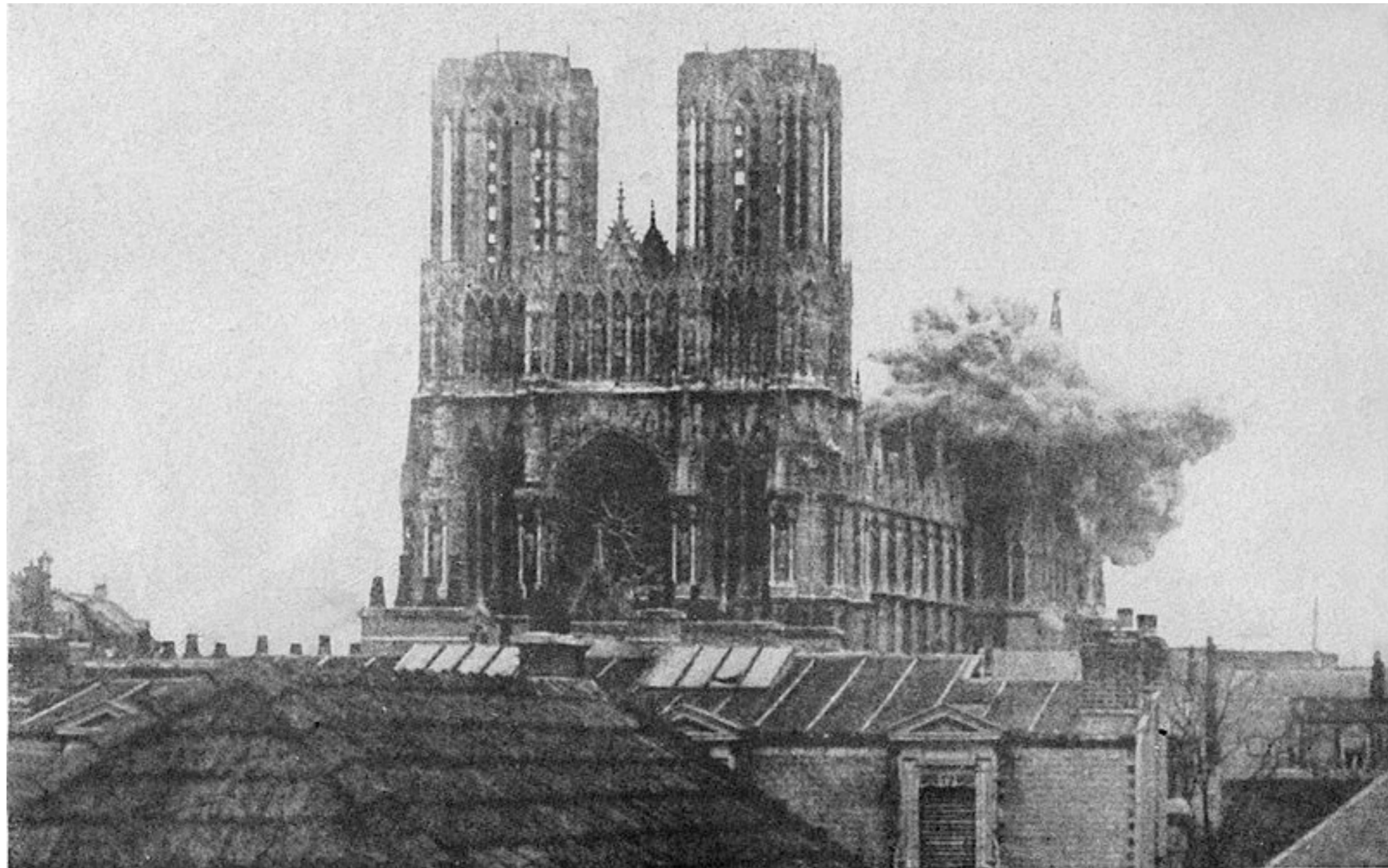
Reims Cathedral, 1914 (now public domain)

http://en.wikipedia.org/wiki/File:Shell_Explosion_Cathedral_at_Rheims_retouched_image.jpg